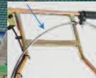
Clear protective plastic tube over disc lifter cable