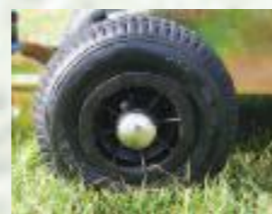
PNEUMATIC TYRES Provides excellent stability and maneuverability. Provides smooth ride over all surfaces