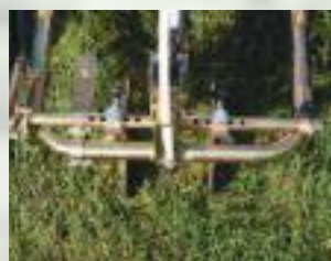
ADJUSTABLE WIDTH SPACERS Pre-drilled disc spacers for quick line width changes, front bumper bar protects nozzle assembly

Using a single 10 litre drum of Impact ready-to-use paint, 8 pitches can be marked without returning to base