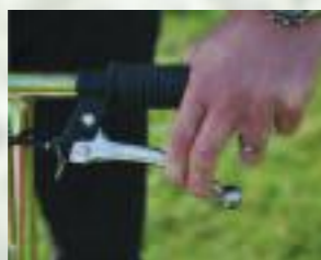
DISC LIFT* Finger-tip control lifts and locks discs when applying staggered lines or moving from one pitch to another