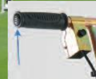
Safety handle bar grip-end plastic inserts to protect from knocks