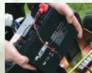
RECHARGEABLE BATTERY Battery can be charged on the machine or simply removed for off-site charging