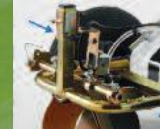
Adjustable stop bracket to lock in place preferred height adjustment