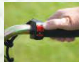
POWER SWITCH Simple on-off push-button for instant control of paint delivery