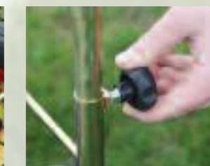
ADJUSTABLE HANDLEBARS Easily adjustable for operator preference and comfort