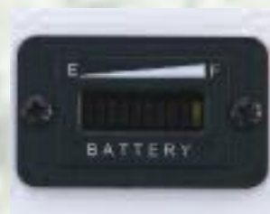
LED INDICATOR* Battery charge indicator shows at a glance when battery requires charging