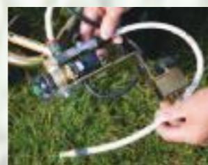
SOLENOID VALVE* Allows immediate cut-off of spray. Eliminates paint leakage and dribbles on the pitch