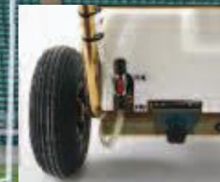
Easy Prime/Spray valve located at the rear

New features on the iGO Prime and iGO Midi