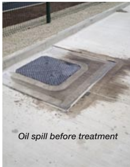
Oil spill before treatment

Target application rate is 1 litre of diluted spray per 10m 2 .