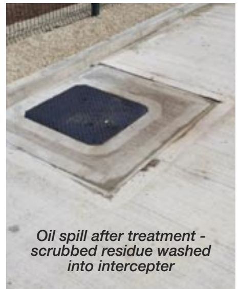
Oil spill after treatment - scrubbed residue washed into interceptor