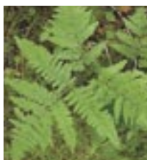
Aktiv against grasses and bracken