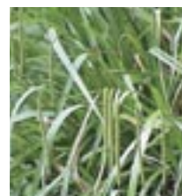
Aktiv against annuals, perennials and aquatic weeds