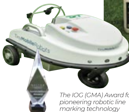
The IOG (GMA) Award for pioneering robotic line marking technology