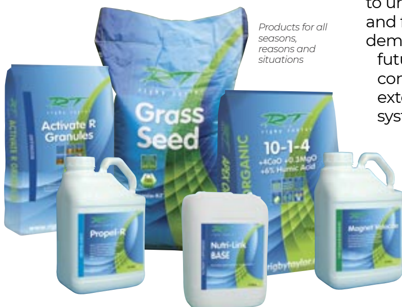
Products for all seasons, reasons and situations

In addition, the group can call upon the expertise from other parts of the Origin group including fertilizer manufacturing, speciality product formulation and supply, line marking machinery and paint manufacturing.