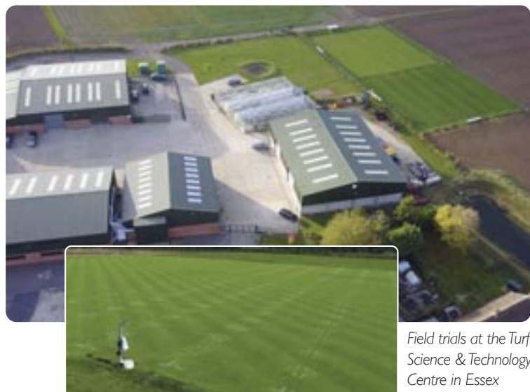
Field trials at the Turf Science & Technology Centre in Essex