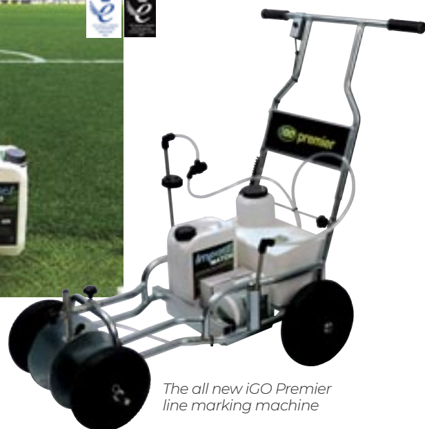
The all new iGO Premier line marking machine