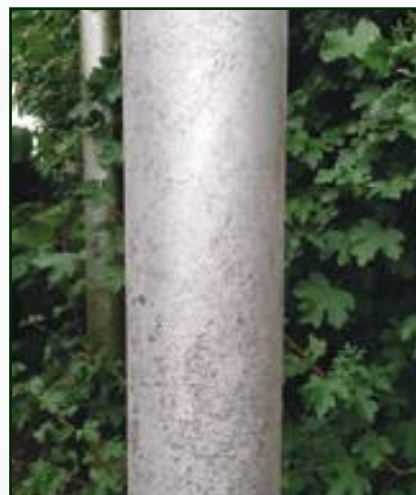
► 1 month after treatment