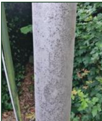
► A few hours after treatment